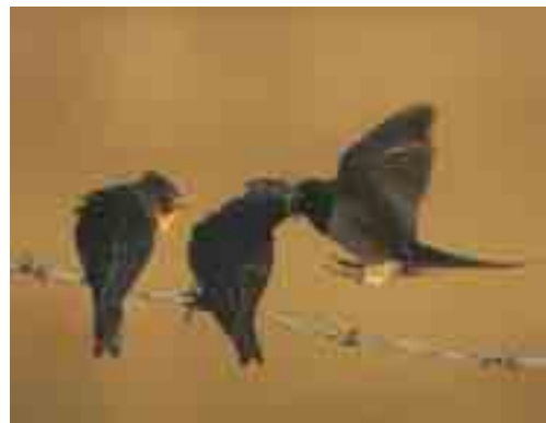
Barn swallows collect dung-associated insects for their young when flying over fields grazed by livestock.